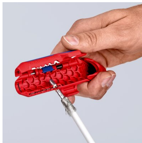
Stripping of a coax cable