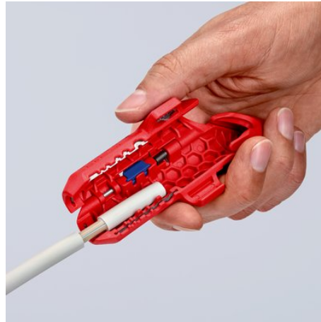
Stripping of a NYM cable