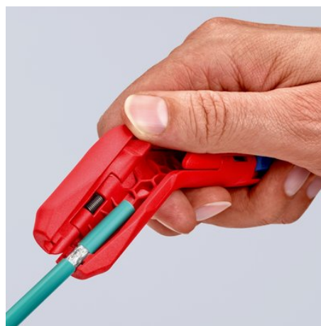
Stripping of a data cable