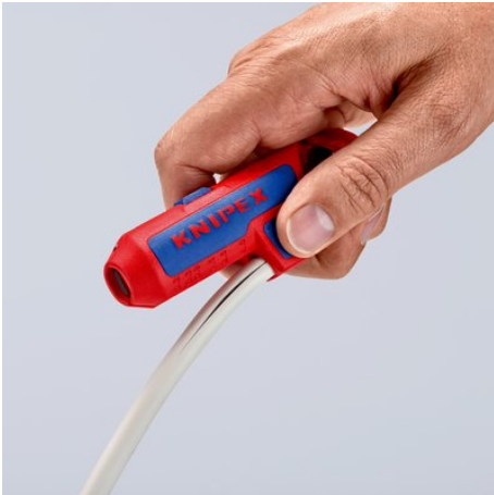
With concealed cutter in overhanging thumb rest on the side for convenient lengthwise cut