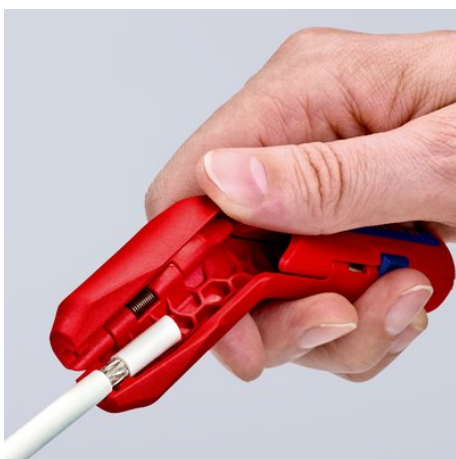
stripping of a coax cable