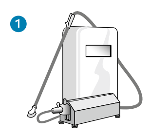
1. Apply by spraying using an acid resistant pump like Avesta SP 25, or by brushing, dipping or circulating depending on application.