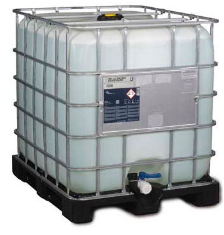
1100 kg IBCs

A consecutive passivation steep using Avesta FinishOne Passivator 630 after using the Cleaner 401 further improves the result and increases time until the next treatment with up to 3 times based on practical experiences.