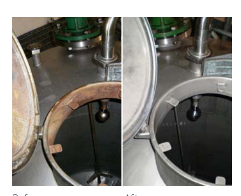
Before After Photo: Maintenance cleaning, Cleaning of tea staining on a stainless manhole using Avesta Cleaner 401 and Passivator 630