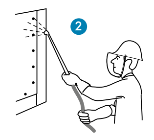
2. When spraying, apply evenly on the entire surface.