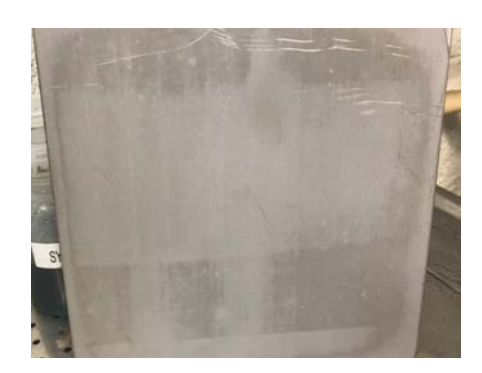
Poor pre-cleaning Photo: Remaining oil on the surface, before pickling, which blocks the pickling acids from cleaning and causing discolorations

Photos: Available in several packages (Sizes may differ from markets)