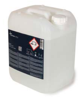
20 kg drums

Photos: Available in several packages (Sizes may differ from markets)