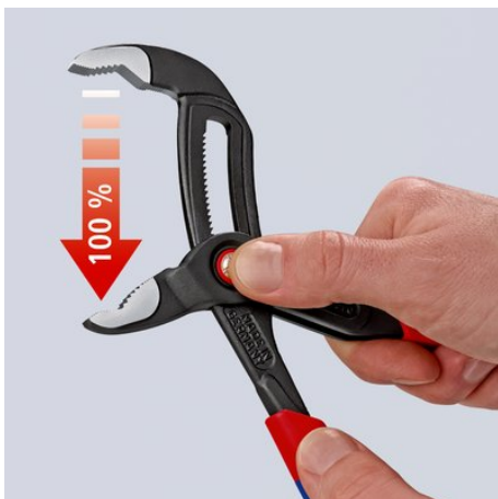
Press the button – open pliers completely